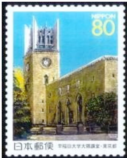
Okuma auditorium at Waseda University

From the land of the rising Sun, a series of talks on the Algebraic Geometry studied at Waseda University: